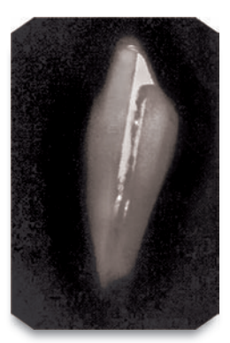
Placing material traditionally with composite placement instruments, spatulas or spiral paste fillers