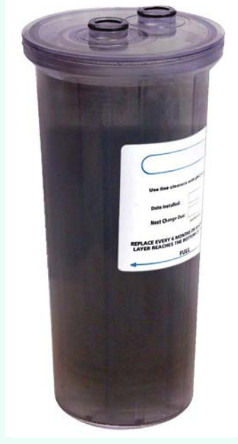
FIGURE 5 - Suction filter (before).

Microbiology-based cleansing products are typically safer than their chemical counterparts; they are organic and do not contain any materials that are harmful to people or the environment. They clean very differently from traditional compounds that dissolve accumulated waste, leaving it to settle elsewhere in the system such as traps, filters, pipe walls or amalgam separators; microbiologybased cleaners rely on living bacteria to eat/digest organic waste. The bacteria consume prophylaxis paste, organic tissues, and other waste materials. The more waste