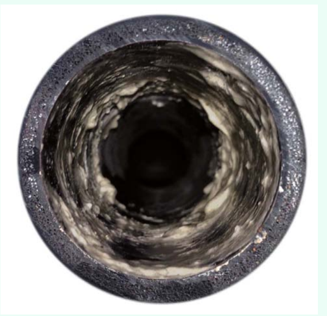
FIGURE 2 - Debris inside suction pipe after Bio-Pure Microbial Cleaning.

It is a good and important clinical exercise for every practice to accurately measure their suction power level as part of their annual evacuation pump service.