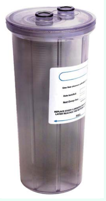
FIGURE 6 - Suction filter (after).

there is, the more the bacteria digest (Figs. 3&4).