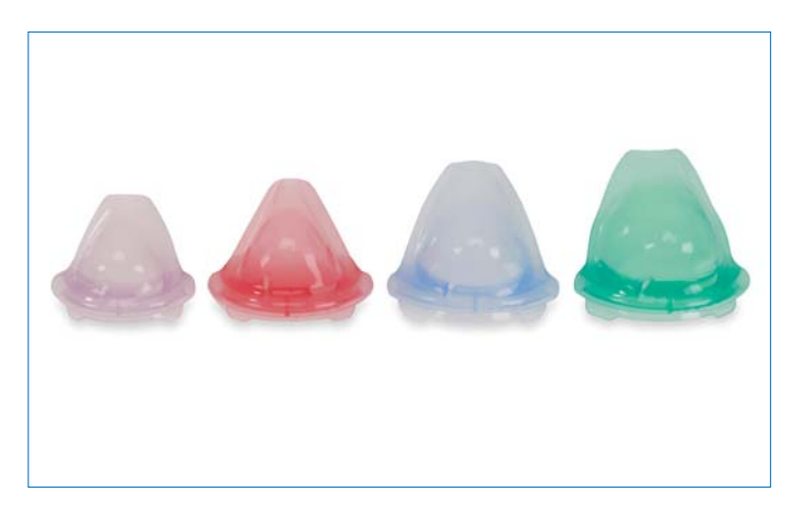
SILHOUETTE Color Coded Sizer Masks