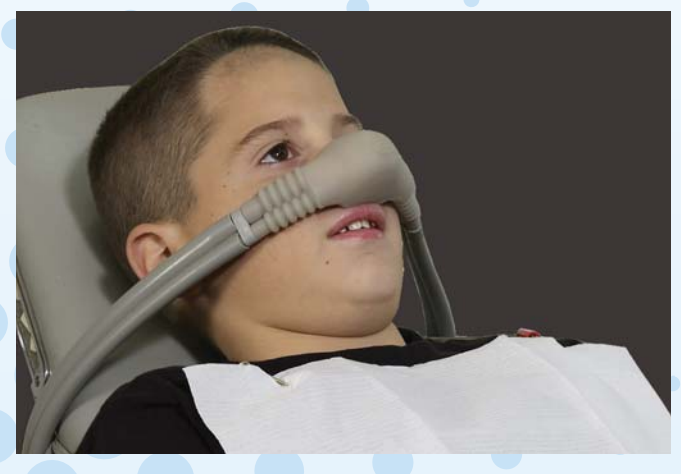
Traditional nasal mask