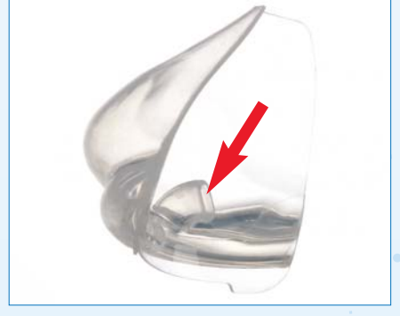
Specially engineered nasal cannula for patient comfort and effective N2O delivery.