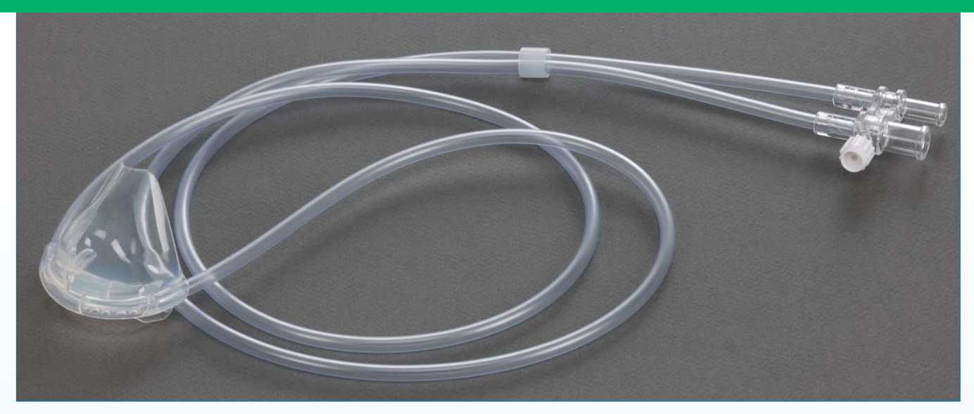
SILHOUETTE Single Patient Use Nasal Mask and Breathing Circuit