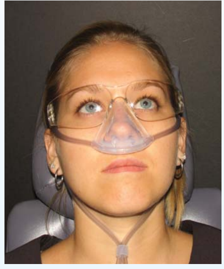
The Silhouette mask is available in 4 sizes: Pedo, Adult Small, Medium and Large resulting in a perfect fit for all of your patients.