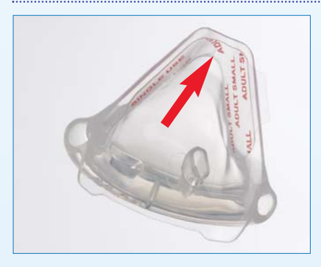
Adhesive strip secures mask in place.