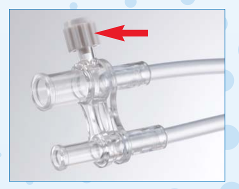
Capnography Luer Lock on every circuit for convenient sample line connection.

VISIT OUR WEBSITE FOR INFORMATION ON HOW TO ORDER, VIDEOS, PHOTOS AND FAQS. WWW.PORTERINSTRUMENT.COM/SILHOUETTE