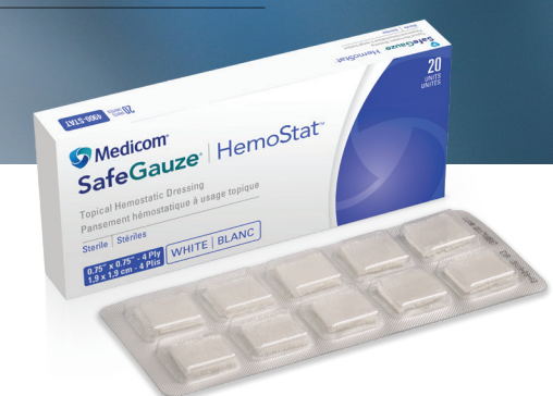
Major Components of Hemostasis

Natural hemostasis is the body's normal physiological response to control, prevent, and stop bleeding. (See Major Components of Hemostasis.) It can be primary or secondary. In primary hemostasis, local vascular contraction reduces blood flow to the injury site and platelets form plugs. Secondary hemostasis consists of the cascade of coagulation. These two process happen simultaneously and are mechanistically intertwined. Various factors and inhibitors interact to clot plasma. Natural hemostasis can be difficult to achieve when the body is under stress, so other methods must be used to stimulate it. To plan for hemostatic needs, collect a complete medical history from each patient. (See Know Before You Cut.)